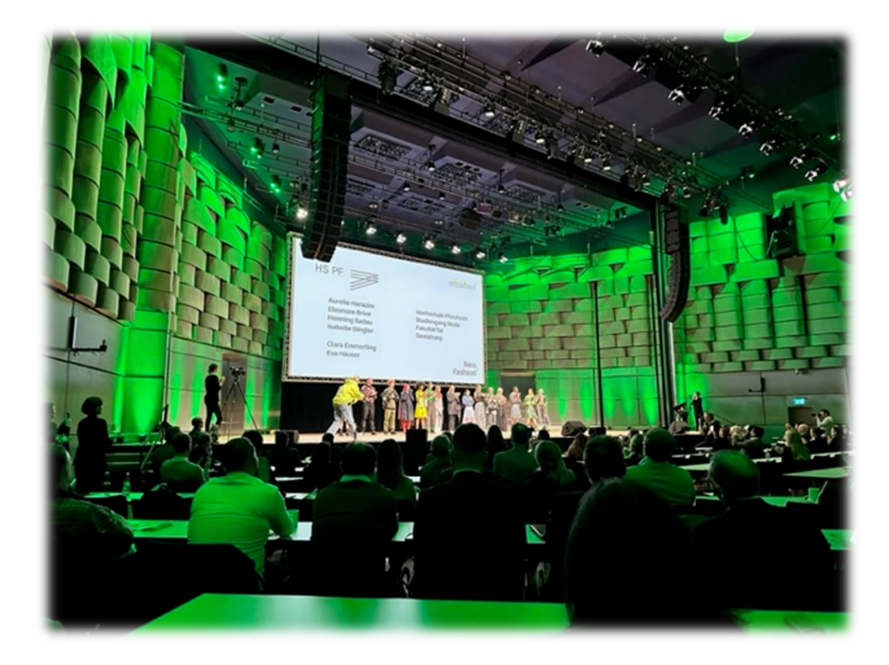
Figure 3: Graduate Fashion Designers and Models in Sustainable Fashion

As a highlight of the programme, a fashion show, specially put together for the conference, was presented partly virtually and partly in person. This was coordinated by the Niederrhein University of Applied Sciences, Department of Textile and Clothing Technology, and the Institute of Textile Technology at Aachen University and, with the help of digital presentations, referred to current topics that are not only of concern to the fashion world: diversity, sustainability and technical innovation.