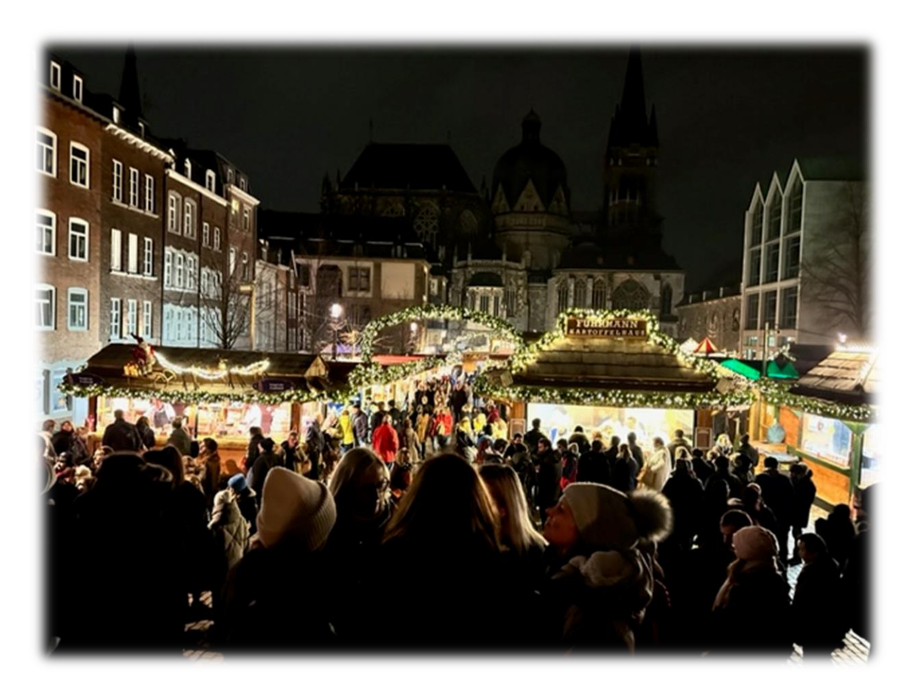
Figure 5: Christmas Market in Aachen

The day's programme was rounded off by a festive event in the Coronation Hall in Aachen, where postal prizes were awarded to young scientists. In addition, the Christmas market in Aachen invited participants to take a stroll through the city.