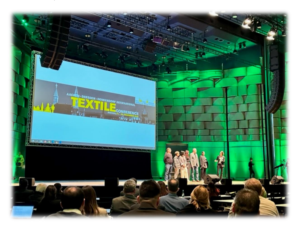
Figure 2: Group of Organisers of the Fashion Show

The textile and apparel industry of the future is emission-free, digital and uses sustainable, recyclable raw materials, its supply chains are secure and transparent. In addition, it responds flexibly to market changes through regional on-demand manufacturing. In the present, these megatrends are being worked out at full speed in research, industrial development and design. The results of this work were presented at ADD-ITC 2022 in 20 plenary and keynote speeches as well as 36 contributed talks and over 100 poster contributions.