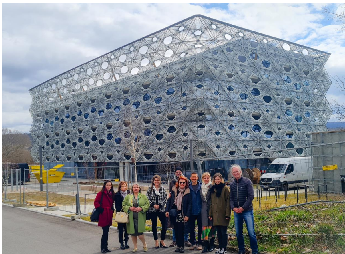
Figure 1: Consortium members of the Fashion DIET project in front of the “Texoversum”

From 21 to 23 March 2023, the third and last “Learning Teaching and Training” (LTT) event took place as part of the Fashion DIET project at the TEXOVERSUM Faculty at Reutlingen University. This last LTT could be held in a hybrid format, which was a nice development compared to the two previous ones, which could only take place online due to COVID-19. While the consortium members met in person on site during all three days, the second day managed to significantly expand the number of participants by including a considerable number of online participants, which led to an extremely fruitful exchange.