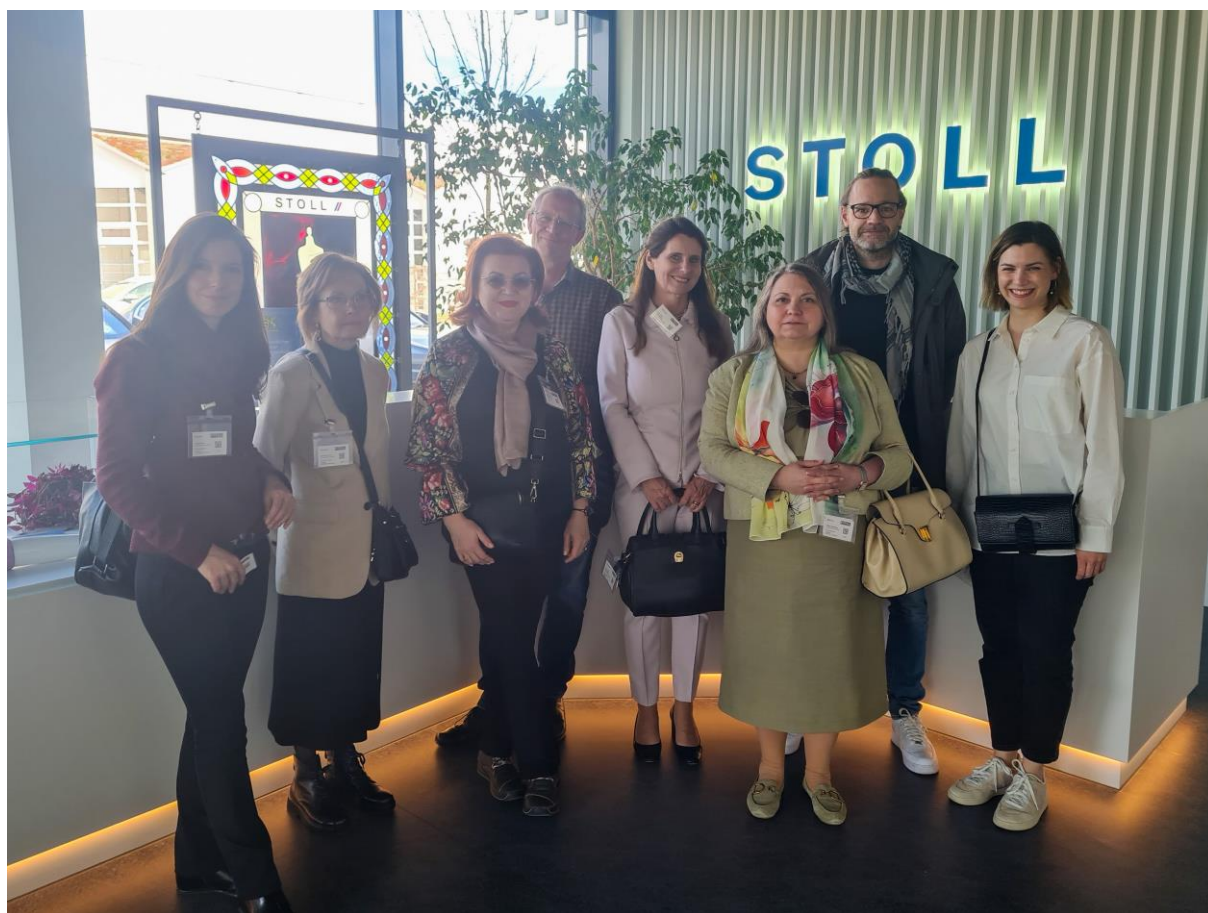
Figure 5: Fashion DIET Consortium at the company “Karl Mayer Stoll”