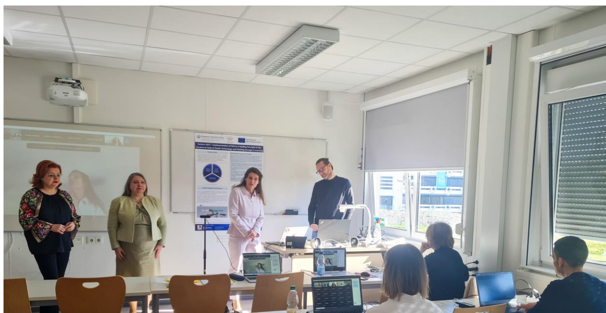
Figure 3: Introduction of the Project Partner