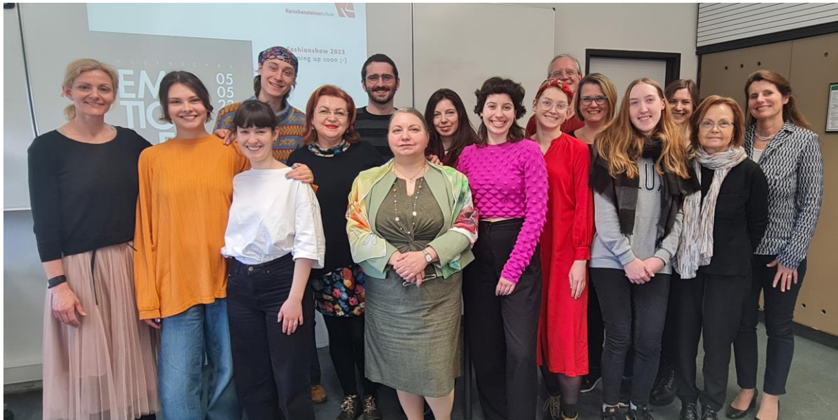
Figure 6: Pupils of the Kerschensteinerschule in Stuttgart together with the Consortium Members

In the afternoon, the consortium continued their activities with a guided city tour called “Future Fashion Walk”. These tours are offered by the Ministry for the Environment, Climate and Energy Management Baden-Württemberg as a part of Education for Sustainable Development. During this tour of Stuttgart, outstanding sustainable fashion labels, second-hand shops and innovative concepts such as the “Kleiderei”, where clothing and accessories can be rented on a monthly basis, were visited.