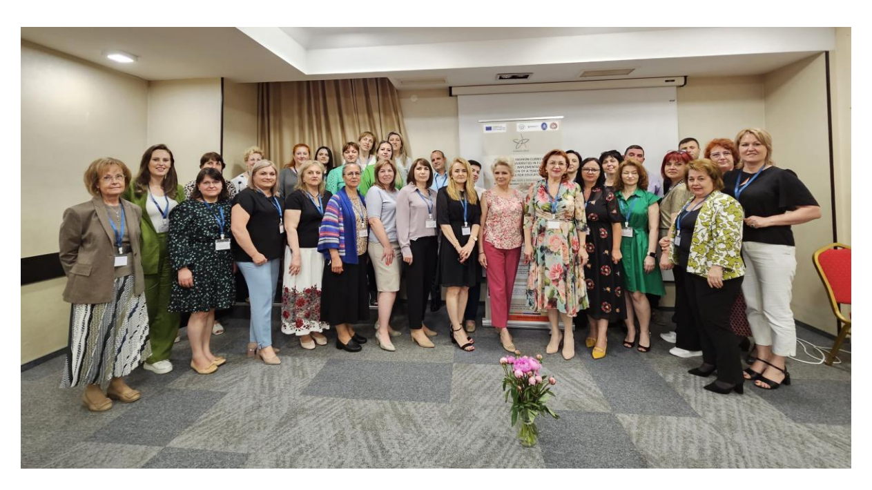
Figure 2: Group photo of the organisers with participants from Romania and the Republic of Moldova.

The 56 participants were mainly composed of primary and high school teachers, as well as university professors from Romania and the Romanian-speaking part of the neighbouring country, the Republic of Moldova. The project team and the Technical University "Gheorghe Asachi" (TUIASI) staff participated as well. Some students were also involved in the organisation of the event as volunteers with great commitment.