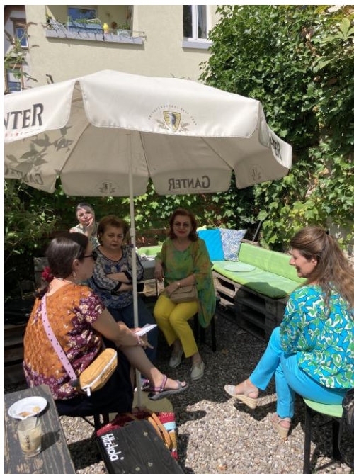
Figure 3: The Fashion DIET team enjoyed a short rest in the garden of a repair café during the AIFORIA Future Fashion walk.

To ensure a sustainable impact beyond the end of the project, measures were discussed and upcoming tasks and responsibilities were defined with regard to the project goals and sustainability.