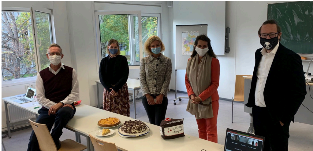
Figure 1: Mutual coffee and cake break during the Fashion DIET kick-off-meeting. The team in Reutlingen (persons in the background), well protected with facemasks, presented their cakes to share the culinary heritages with the online attending colleagues. Cakes in front from left to right: apple pie, crumble cake and Black Forest gâteau, escorted by a textile object.