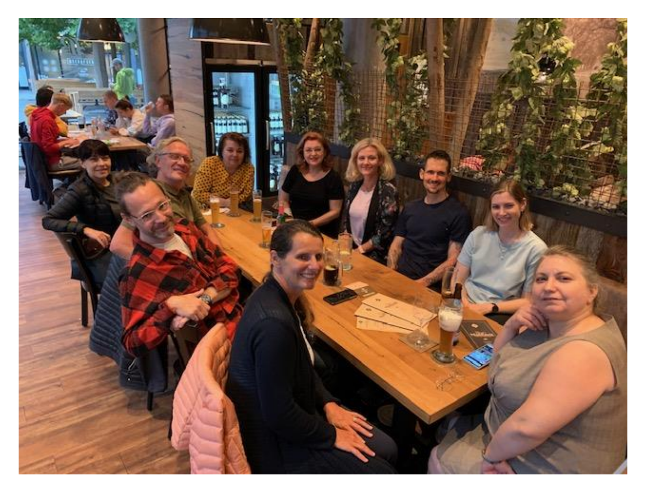
Figure 4: Get together at Reutlingen city