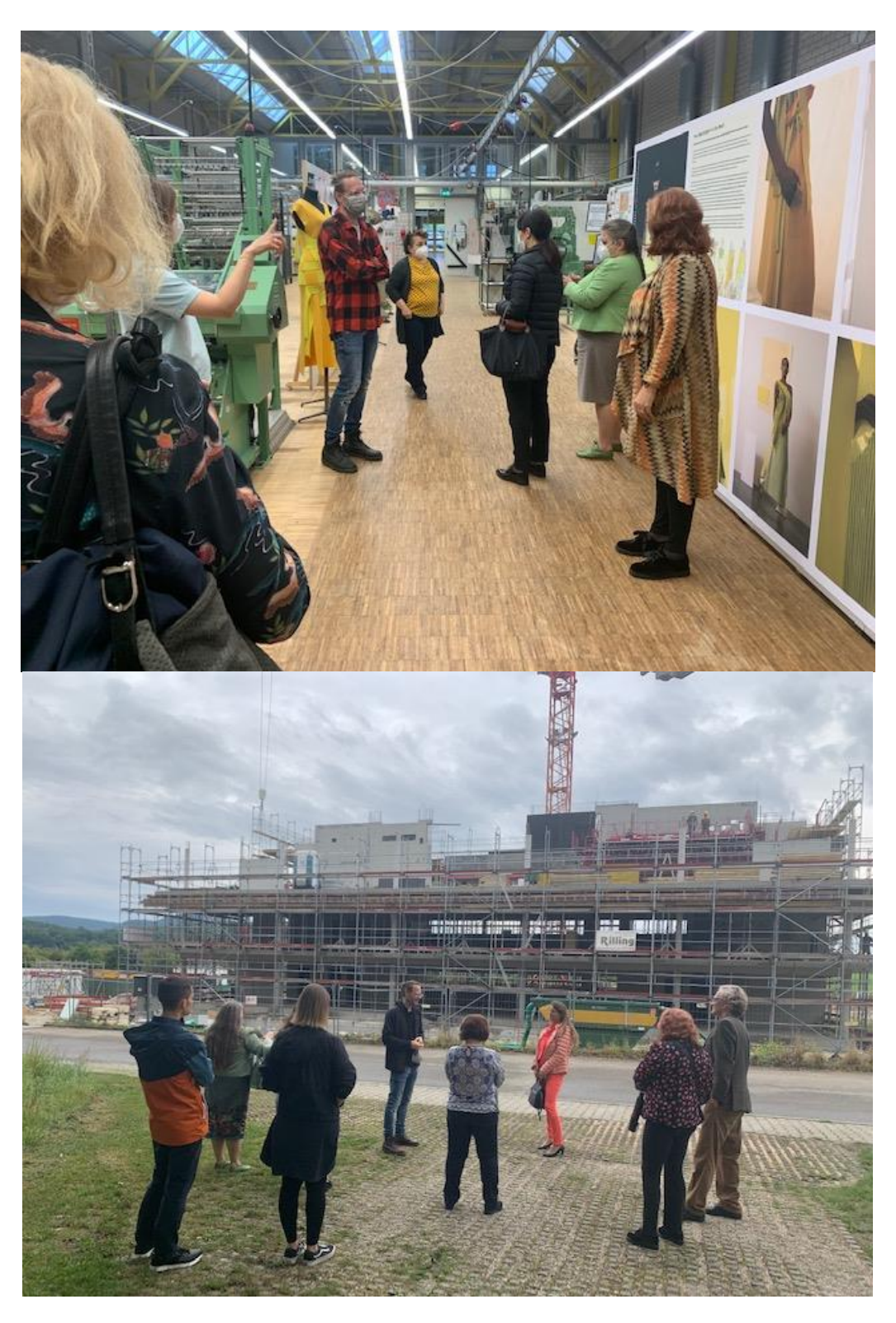
Figure 3 a, b: Visit of the textile laboratories (a) and the Texoversum construction site (b) at Reutlingen University

The meeting in Reutlingen ended with a discussion of open questions and upcoming tasks and responsibilities. All in all, it was another fruitful and joyful exchange. Now, the team is looking forward to meet hopefully again in person at the next Transnational Meeting in Yambol, Bulgaria in April 2022.