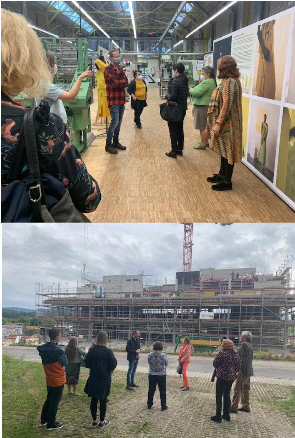
Figure 3 a, b: Visit of the textile laboratories (a) and the Texoversum construction site (b) at Reutlingen University

The meeting in Reutlingen ended with a discussion of open questions and upcoming tasks and responsibilities. All in all, it was another fruitful and joyful exchange. Now, the team is looking forward to meet hopefully again in person at the next Transnational Meeting in Yambol, Bulgaria in April 2022.