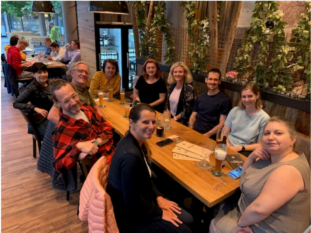
Figure 4: Get together at Reutlingen city